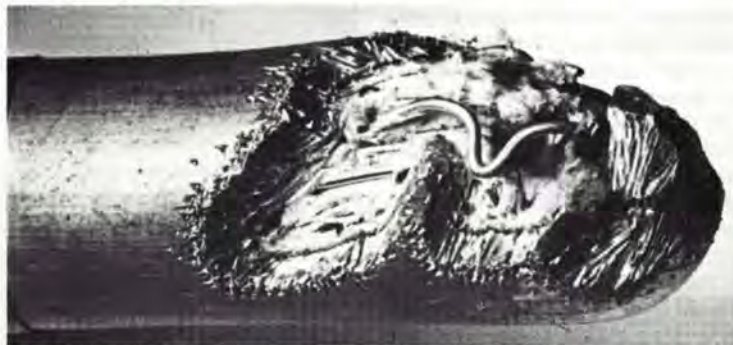
A close-up photograph showing the extent of the damage to a section of cable caused by not-very-nice mice.